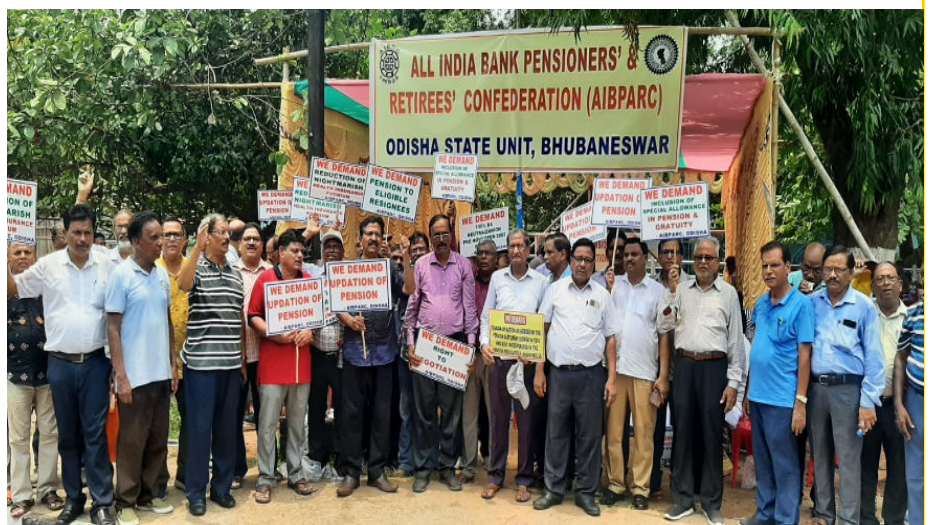
Dharna at Bhubaneswar on 09-06-2023