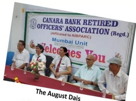
The August Dais