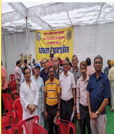
Dharna at Bhopal on 10-06-2023