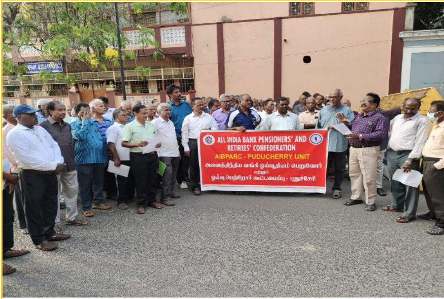
Dharna at Puducherry on 26.06.2023