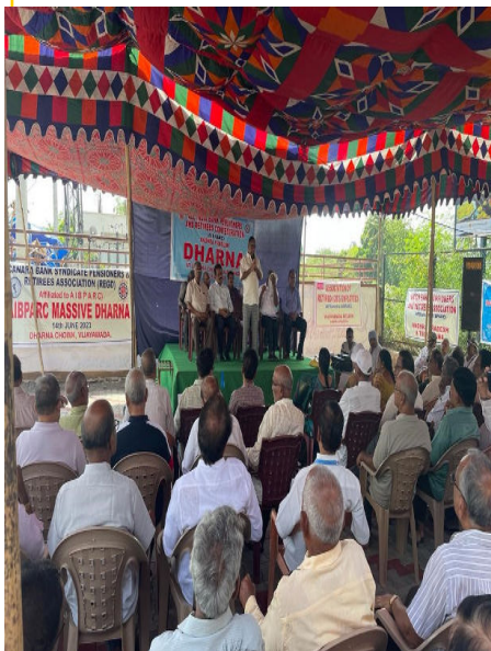
Dharna at Vijayawada on 14-06-2023