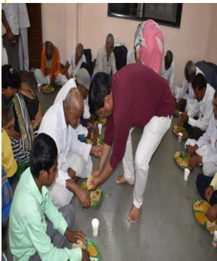
On 13-06-2023 Our Pune unit served food to the devotees of Panduranga Vithal travelling to Pandharapur on foot