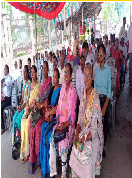
Dharna at Ranchi on 02-06-2023