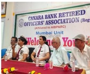
Speeches by the guests of honour