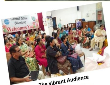
The vibrant Audience