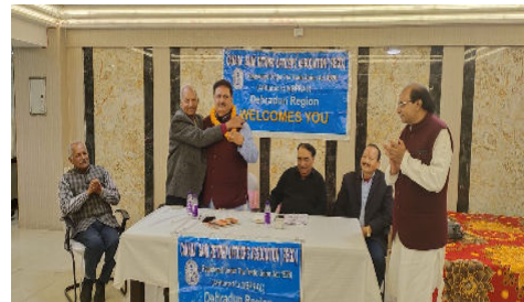
Figure 1 DEHRADUN 15/12/23