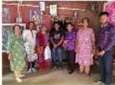
At the village house