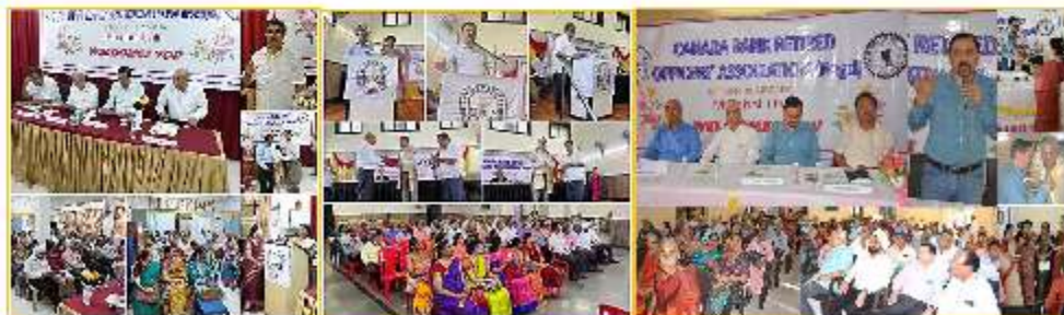
AT HIMALAYA HOUSE, CSMT