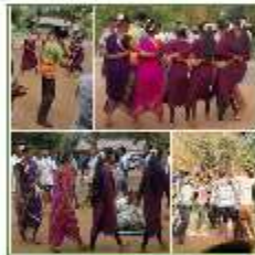
Tarpa, Gauri and Tipri Dances

Any number of words will not do justice to describe the event; perhaps a few pictures will do a better job.