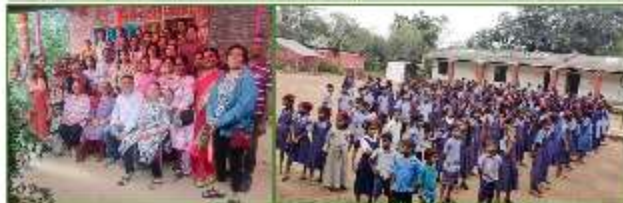
Our Happy Group and at the Village School